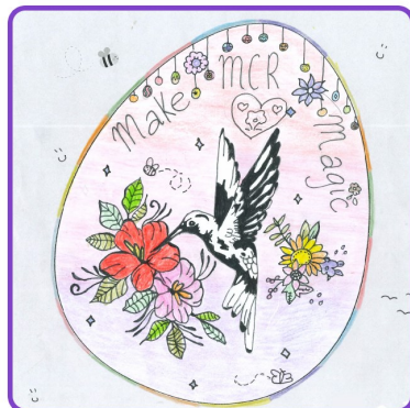
Rolls Crescent Primary