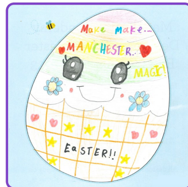
St Mary's Primary