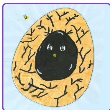
St Philip's Primary