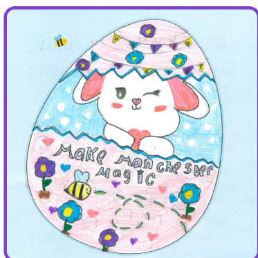
St Mary's Primary